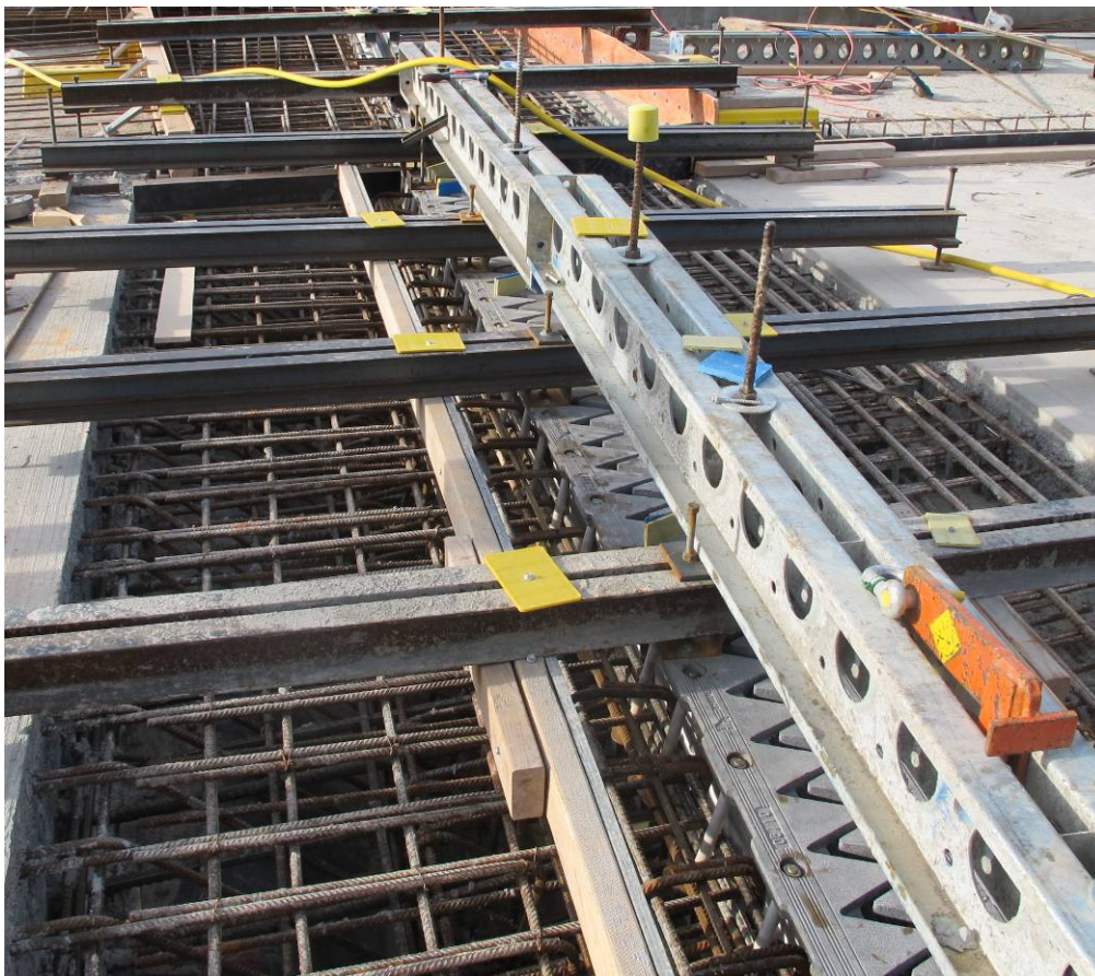
The installer preferred to preassemble joint adjacent to expansion gap and then lift into position with use of strong-backs. (Alternatively the joints can be assembled in situ.)