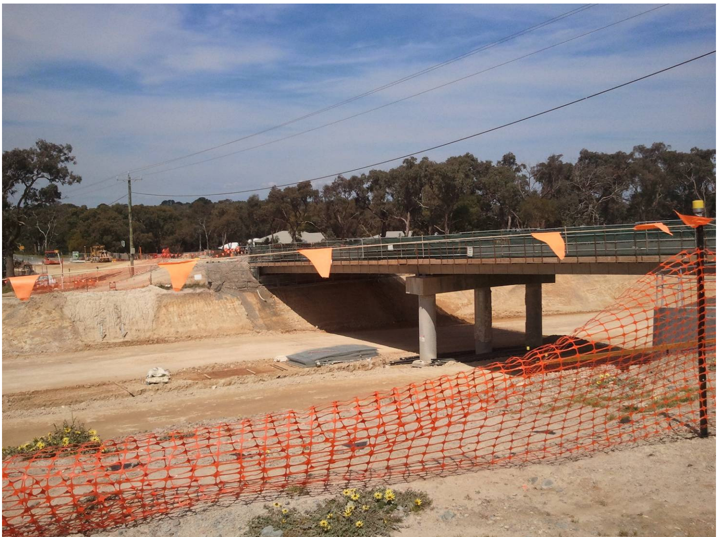
Robinsons Rd Bridge over Peninsula Link, Melbourne

The first of the joints are now going in, including Granor Etic® EJ110 aluminium saw-tooth expansion joints recently installed into the Robinsons Road Bridge. In total Granor will be supplying approx 400 metres of expansion joints, including more aluminium saw-tooth, steel finger joints, as well as Granor "AC-AR" aluminium strip seal joints.